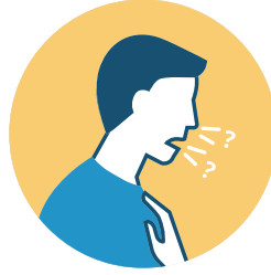
NEW LOSS OF TASTE OR SMELL

*particularly new onset of severe headache, especially with fever