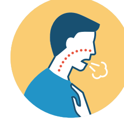
SHORTNESS OF BREATH OR DIFFICULTY BREATHING