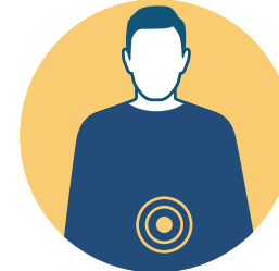
DIARRHEA, VOMITING OR ABDOMINAL PAIN

*especially new onset, uncontrolled cough