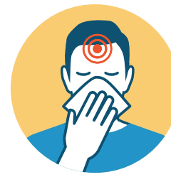
CONGESTION OR RUNNY NOSE