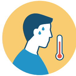
FEVER 100.4* OR CHILLS

*or school board policy if threshold is lower