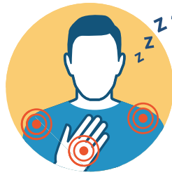
MUSCLE OR BODY ACHES OR FATIGUE